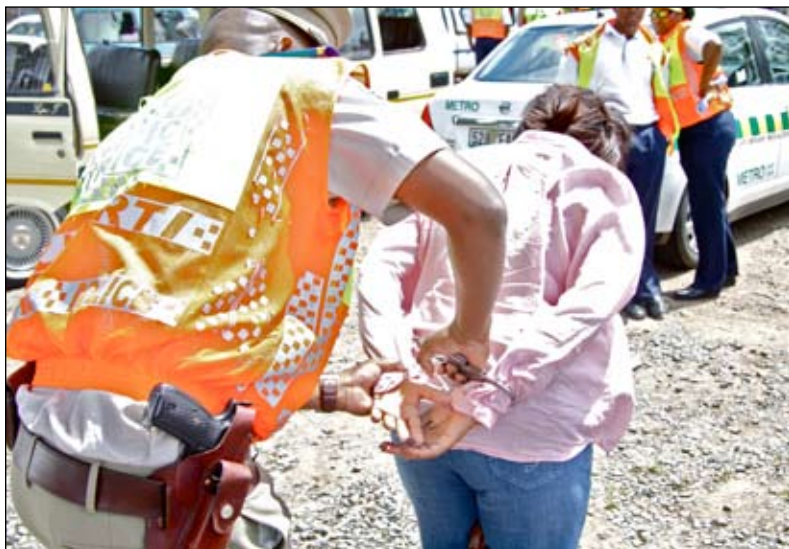
A road traffic officer arresting a woman who was caught driving under the influence of alcohol above the legal limit.

T HE MEC has committed his Department to "galvanize communities to actively participate in curbing carnage on the road because the responsibility for road safety rests with each and every individual".