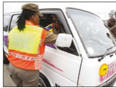
A traffic law enforcement officer at work.

T HE Provincial government is enjoying the fruits of its wisdom in bringing together two departments namely, Community Safety and Transport, as public transport operations in KwaZulu-Natal are no longer subjected to endless disruptions caused by instability in the taxi industry. In an on-going effort to police often unnecessary disruptions, disturbances and confrontations in public transport, particularly in the taxi industry, provincial government resolved to amalgamate the two portfolios so that it would