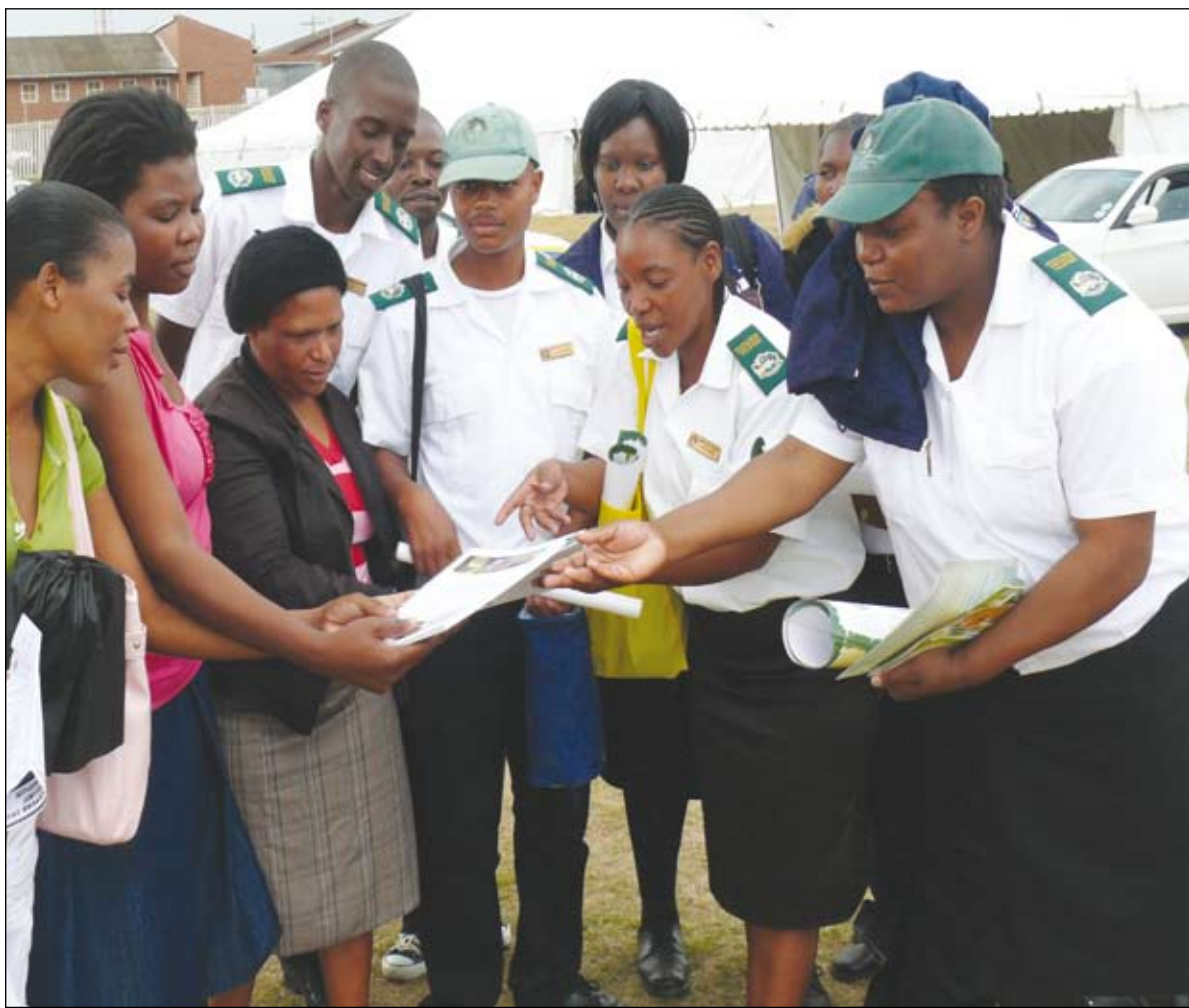
Social Crime Prevention Volunteers are prepared to go all out in the spirit of Batho Pele, as demonstrated by their willingness to avail and explain their services to members of the community.