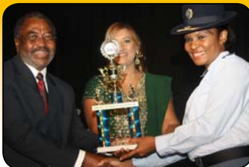
Tribute to women and men in blue See Page 6