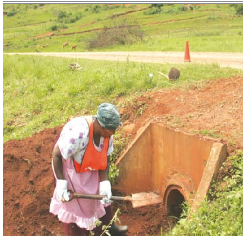
Above: Members of the EPWP's Zibambele road maintenance poverty alleviation programme during the launch of the programme in Ladysmith recently.

THE KZN Department of Transport's flagship programme that feeds the poor as they maintain the roads, known as the