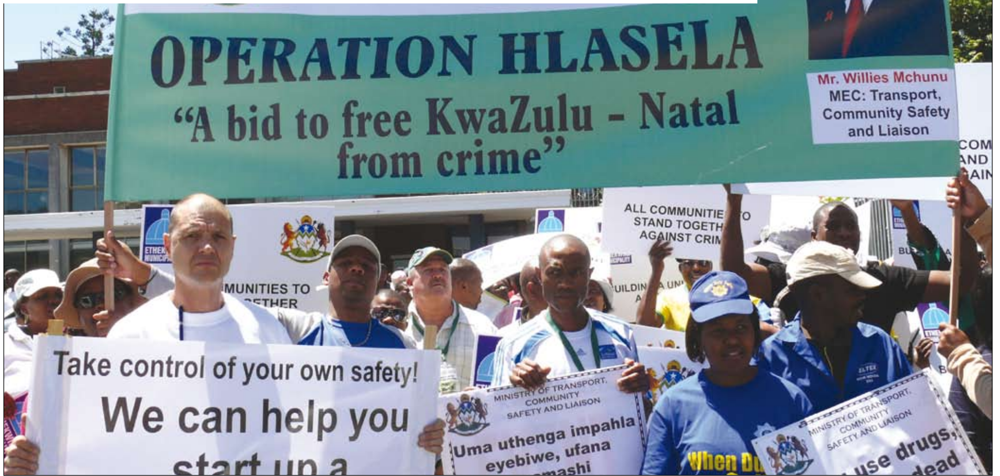
Pinetown residents in an anti-crime march which marked the official launch of the provincial roll-out of Operation Hlasela recently.