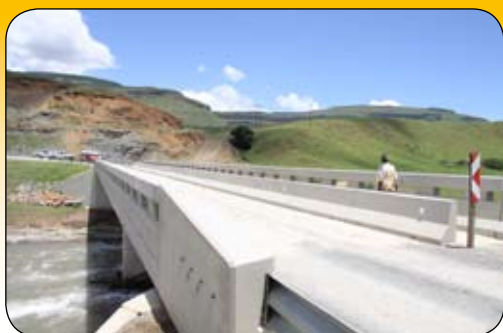
Infrastructure job creation projects improving lives of rural communities See Page 3