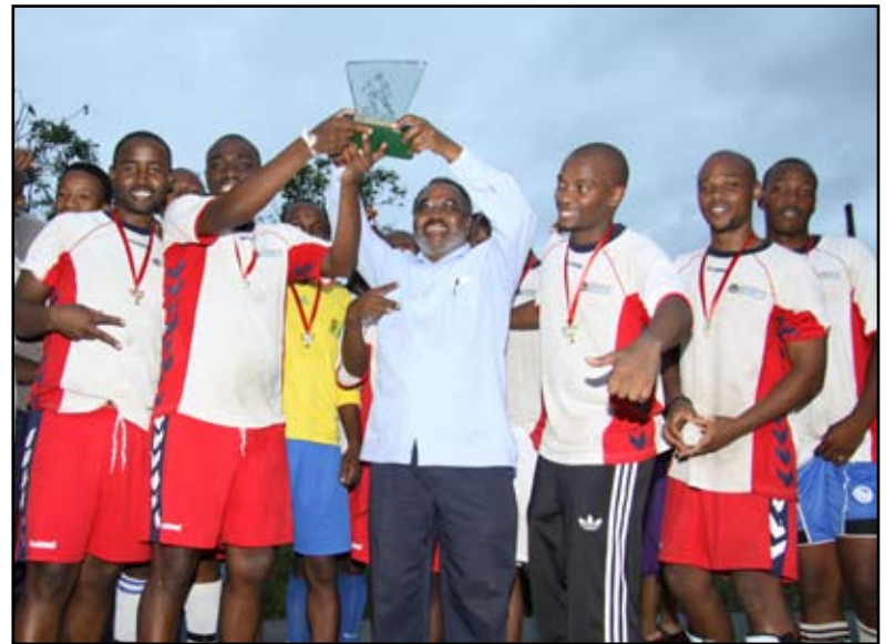
The Road Summit Delegates took part in a soccer tournament with PSL Soccer Legends and the winner was awarded with a trophy by the MEC for Transport, Mr TW Mchunu

MEC Mchunu said, "The people have spoken. It is up to us as a Department to ensure that these resolutions are turned into a provincial Road Safety strategy. These resolutions are a starting point where the Department needs to expand more and find ways to use them effectively."