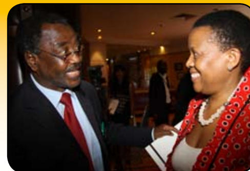
Local election peace pledge See Page 8