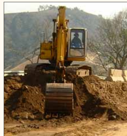
Kuzoshunq'uthuli kuthuthuka i-KZN Bheka ikhasi 2

KwaZulu-Natali-sibambisene ukulwa nezingozi zomngwaqo, ubugebengu nokubulawa kwamaphoyisa